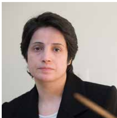
Nasrin Sotoudeh, Detained Iranian lawyer