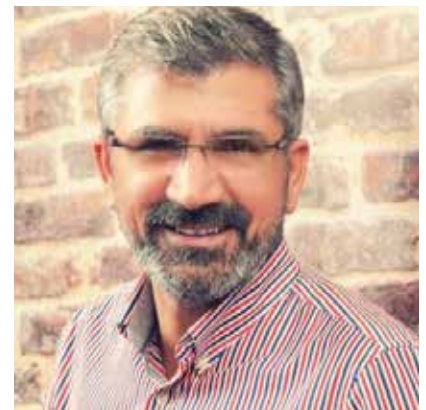
Tahir Elçi, Murdered Turkish lawyer